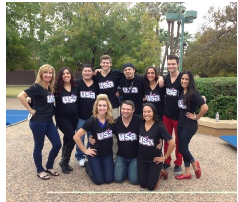
Our Amazing Coaches!

USA offers several youth sports and competitive teams outside of All-Star Cheer to family members. Siblings receive 20% off tuition, and the discounts continue based on the number of children enrolled. All Starz team members received 50% off all tumbling classes. USA offers over 70 tumbling classes weekly between all three gyms. Starz team members also receive 50% off dance classes and flyer technique / stretching classes. Once your athlete becomes a member of the gym, you will receive information on open gyms, camps, special events, and other important information through our monthly newsletter, emails and website updates.